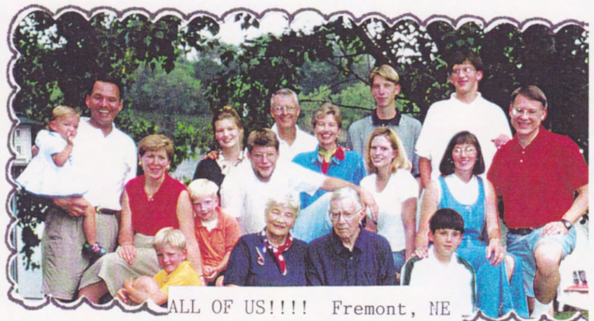
ALL OF US!!!! Fremont, NE