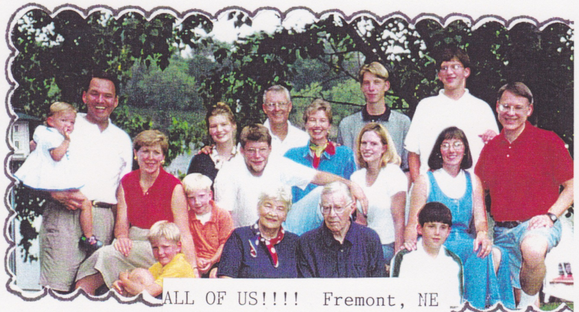
ALL OF US!!!! Fremont, NE